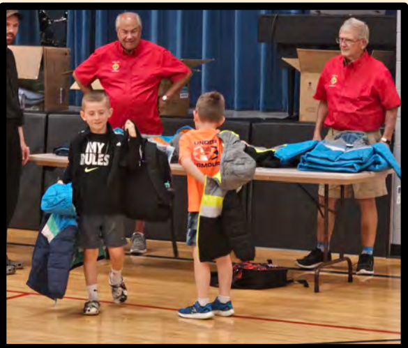
Coats For Kids distribution at St Bronislava Parish, Plover